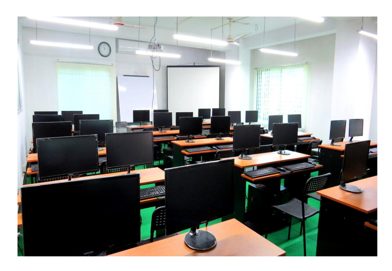
Lab – 1