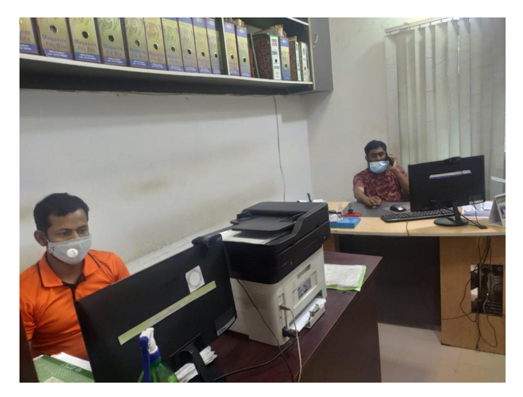
Admin and Account's Room