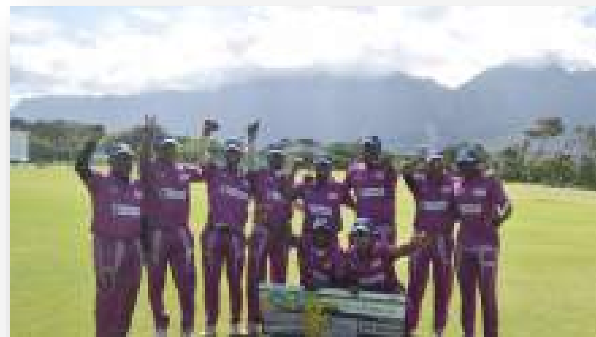
Cape Town 2017