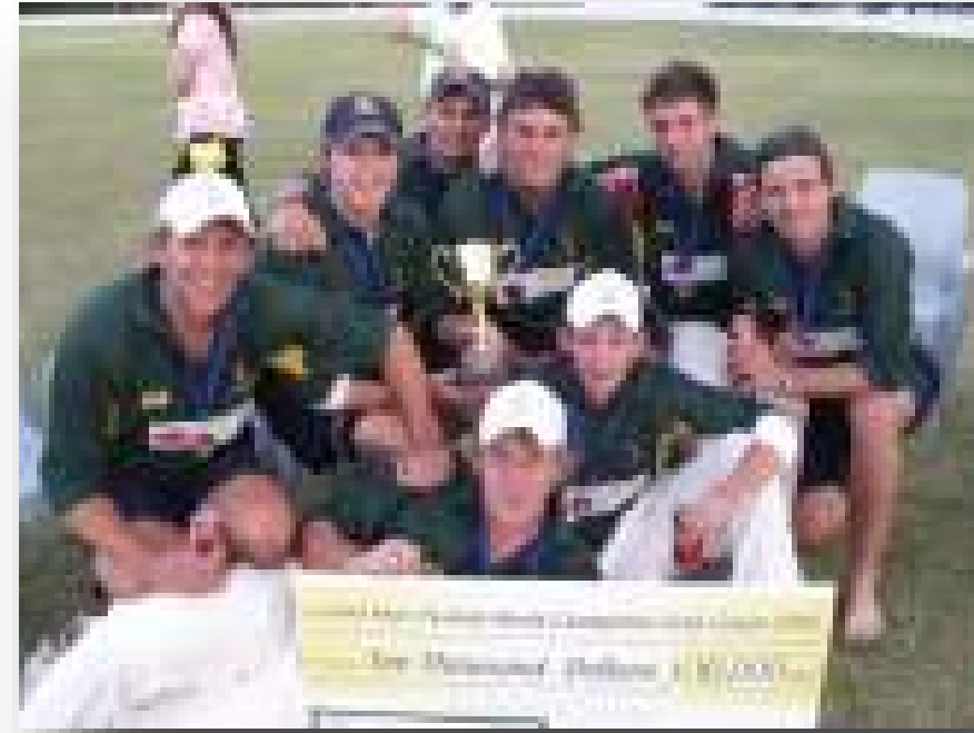
Gold Coast 2010