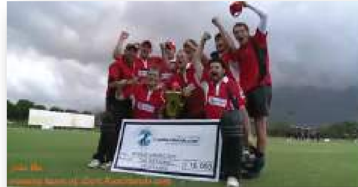
Cape Town 2010