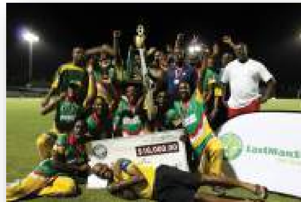
Caribbean (Barbados) 2015